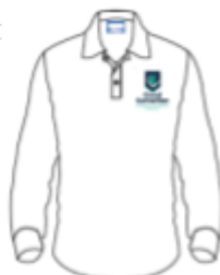
Long sleeve polo