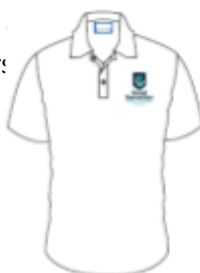
Short sleeve polo