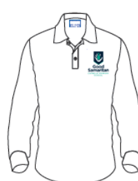
Long sleeve polo