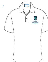
Short sleeve polo