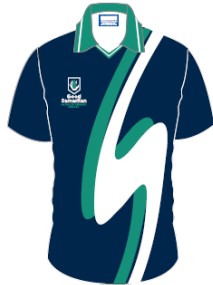
Short sleeve sports top