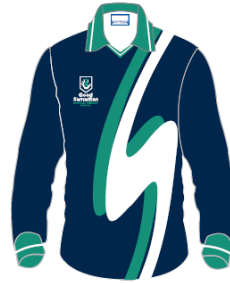
Long sleeve sports top